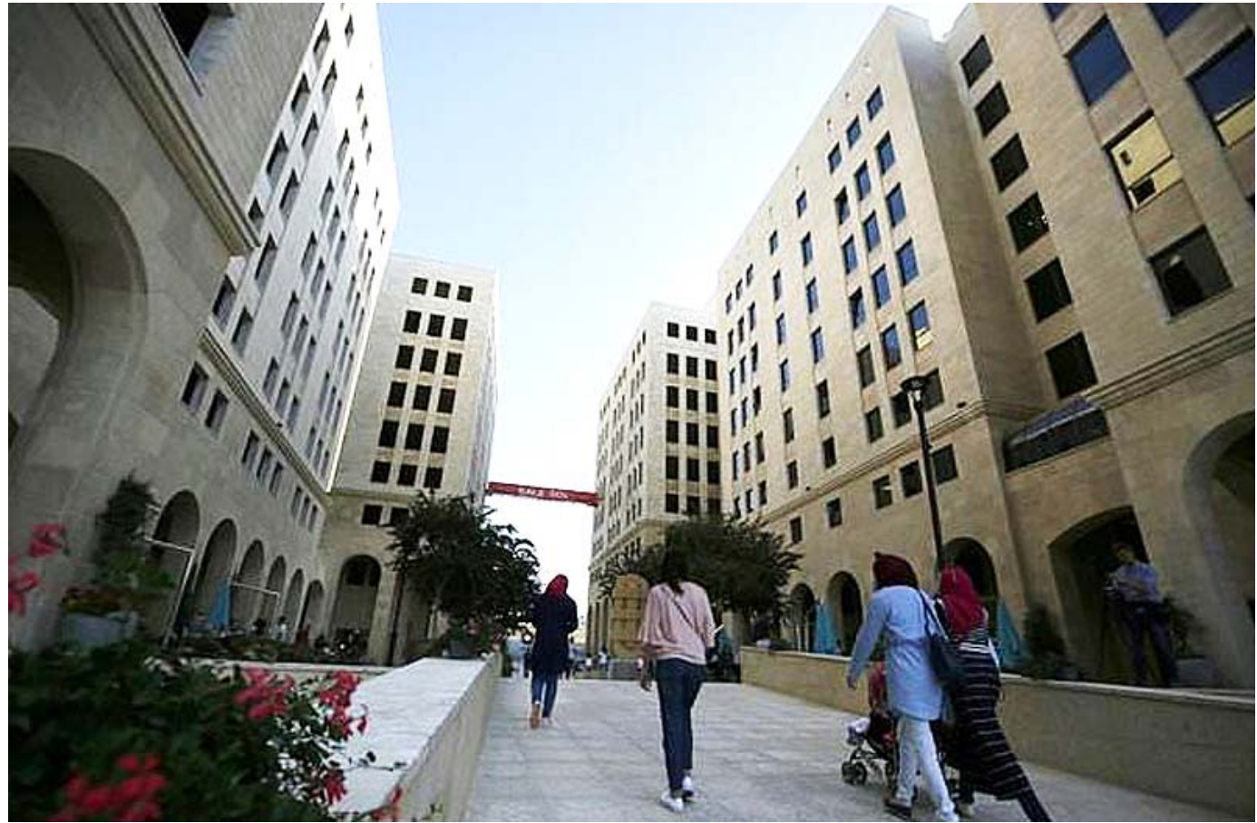
So far only 3,000 people live in the yellow bar tower blocks in the new town of Rawabi.